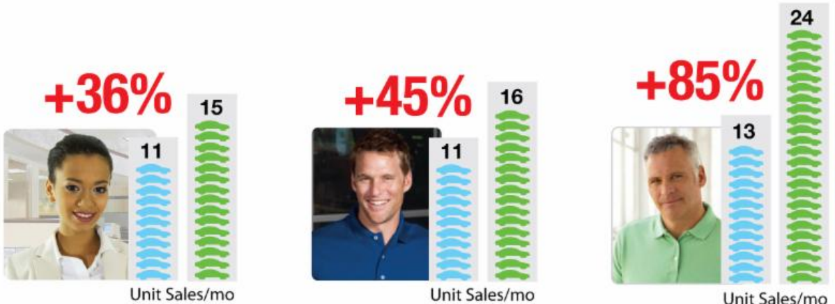
2016 IntellaCar Usage Analysis

How do you pump up your sales team to double digit sales growth? A leading Florida dealership analysis revealed that many of their high achievers share one thing in common - a significant increase in their use of IntellaCar , the iPad selling solution.